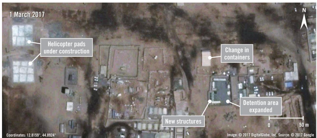
On 1 March 2017, imagery shows the area has been expanded and three new structures are visible. The color and configuration of the containers outside the perimeter has changed, suggesting they were updated or they are new containers. Two new helicopter pads are also under construction.