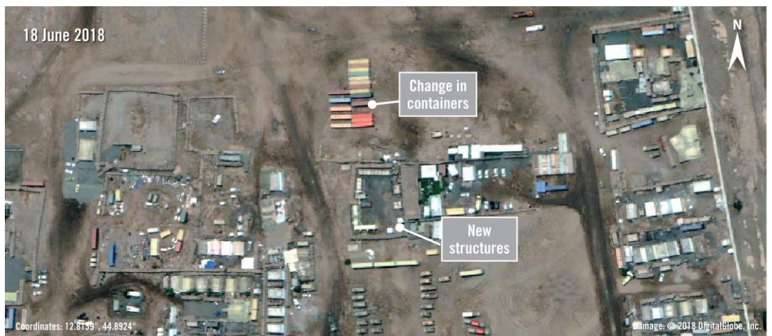
On 18 June 2018, imagery shows a change in the containers and a cluster of new small structures compared to the imagery from March 2017, which would indicate that the facility is likely still being maintained and in use.