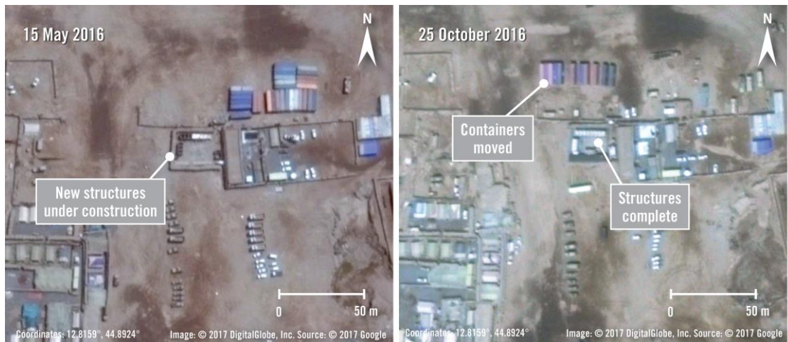
On 15 May 2016, construction of three buildings is visible. Walls of 12 individual rooms with an approximate area of 5m 2 each are apparent. On 25 October 2016, the structures appear complete and containers have been moved nearby, suggesting possible connection with the detention area.