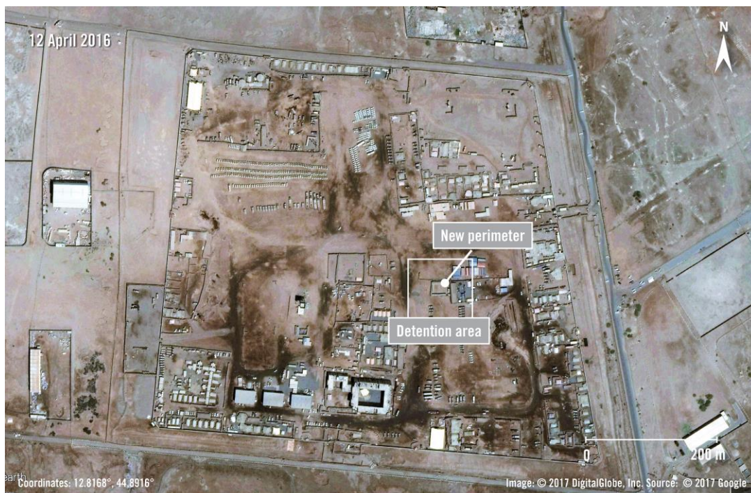
The upper satellite image from 14 July 2015 shows an open area with a walled perimeter in Aden’s Bureiqa district, by 12 April 2016 as seen in the lower image, construction had started within the large perimeter of the base and the perimeter of the detention center becomes apparent.