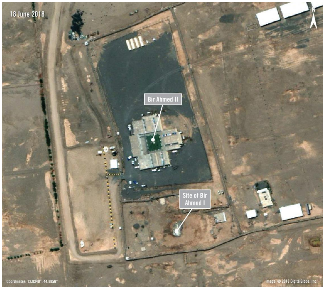
Satellite image from 18 June 2018 shows the site in Aden of the defunct Bir Ahmed I prison and the newer Bir Ahmed II, which became an official detention facility in November 2017.

As the period without news of their disappeared relatives extended into months or even years, families have sought out different ways to obtain information. They have communicated with prison guards on an unofficial basis and have reached out to former detainees who have been released from various informal detention sites to check if they had encountered their missing relatives there. In Aden and al-Mukalla families have been holding protests 69 and have started groups on social networking sites to share information. But that has made them vulnerable to unconfirmed reports, rumors, and false information, exacerbating families' anguish. At one point, a list was circulated on social media with the names of some 20 disappeared detainees rumored to have died in custody.